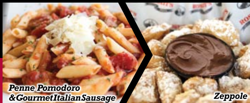
Penne Pomodoro & Gourmet Italian Sausage