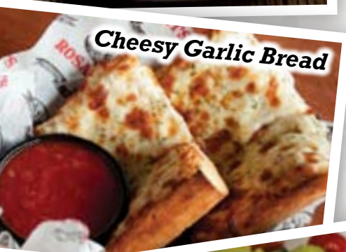
Cheesy Garlic Bread