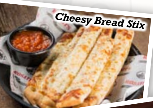
Cheesy Bread Stix