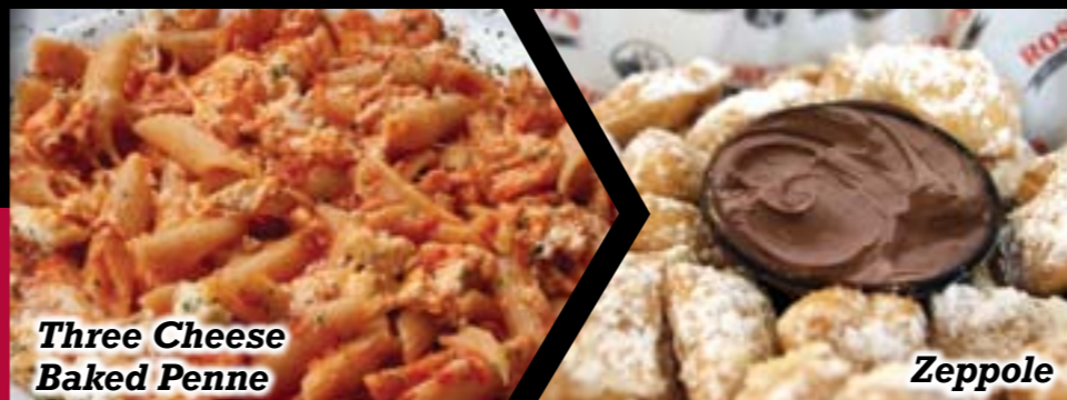
Three Cheese Baked Penne